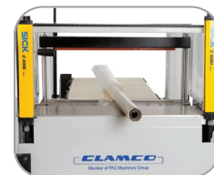
Open loading area for large products.