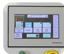
An easy to use interface is provided on a color touchscreen. .